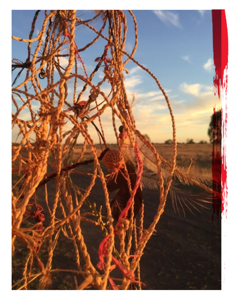
Outbackarts string

Potential audiences have a fairly superficial and stereotypical image of Aboriginal and Torres Strait Islander art. The strongest and most positive aspect of the image relates to the storytelling qualities of Aboriginal and Torres Strait Islander art. Perhaps because of their limited exposure to diverse experiences, potential audiences anchor their perceptions on the ceremonial nature of Aboriginal and Torres Strait Islander art. Such an image is linked to traditional and historical (old) cultural practices that involve the use of the didgeridoo, ochre. dots and body art. Potential audiences view such experiences as spiritual, soulful and serious. The image is positive, but lacks depth and is not strong enough to attract them to Aboriginal and Torres Strait Islander art.