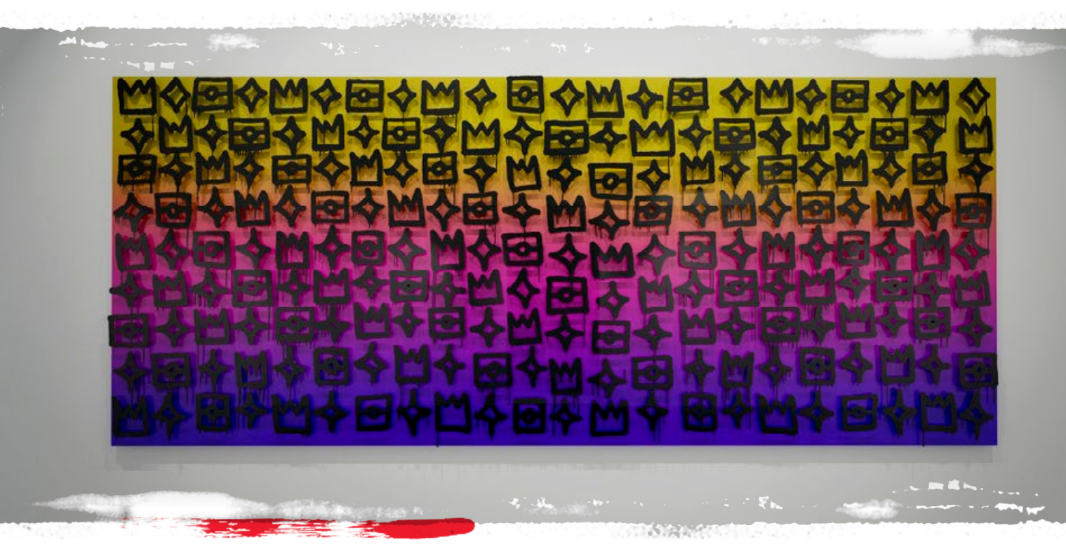
Reko Rennie, Regalia , 2015 aluminium, steel, synthetic polymers 240 x 560 cm Courtesy the artist and Blackartprojects

Profiling Aboriginal and Torres Strait Islander artists and arts workers represents another opportunity to craft a more approachable and relevant image for Aboriginal and Torres Strait Islander art. A member at the NSW forum suggests: