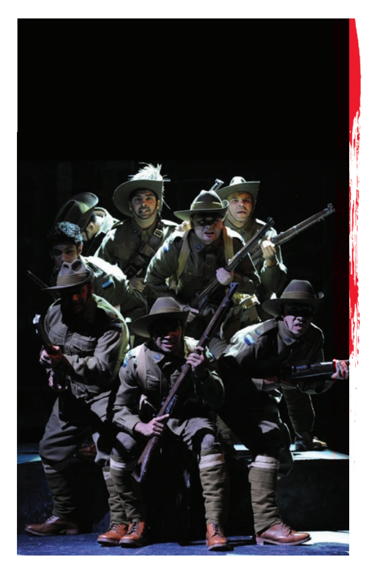
Black Diggers, a Queensland Theatre Company and Sydney Festival production

This current research also identifies that some Aboriginal and Torres Strait Islander practitioners may have difficulty in accessing support. This impedes their ability to develop their arts practice and engage new audiences. As one staff member at a mainstream visual arts organisation states: