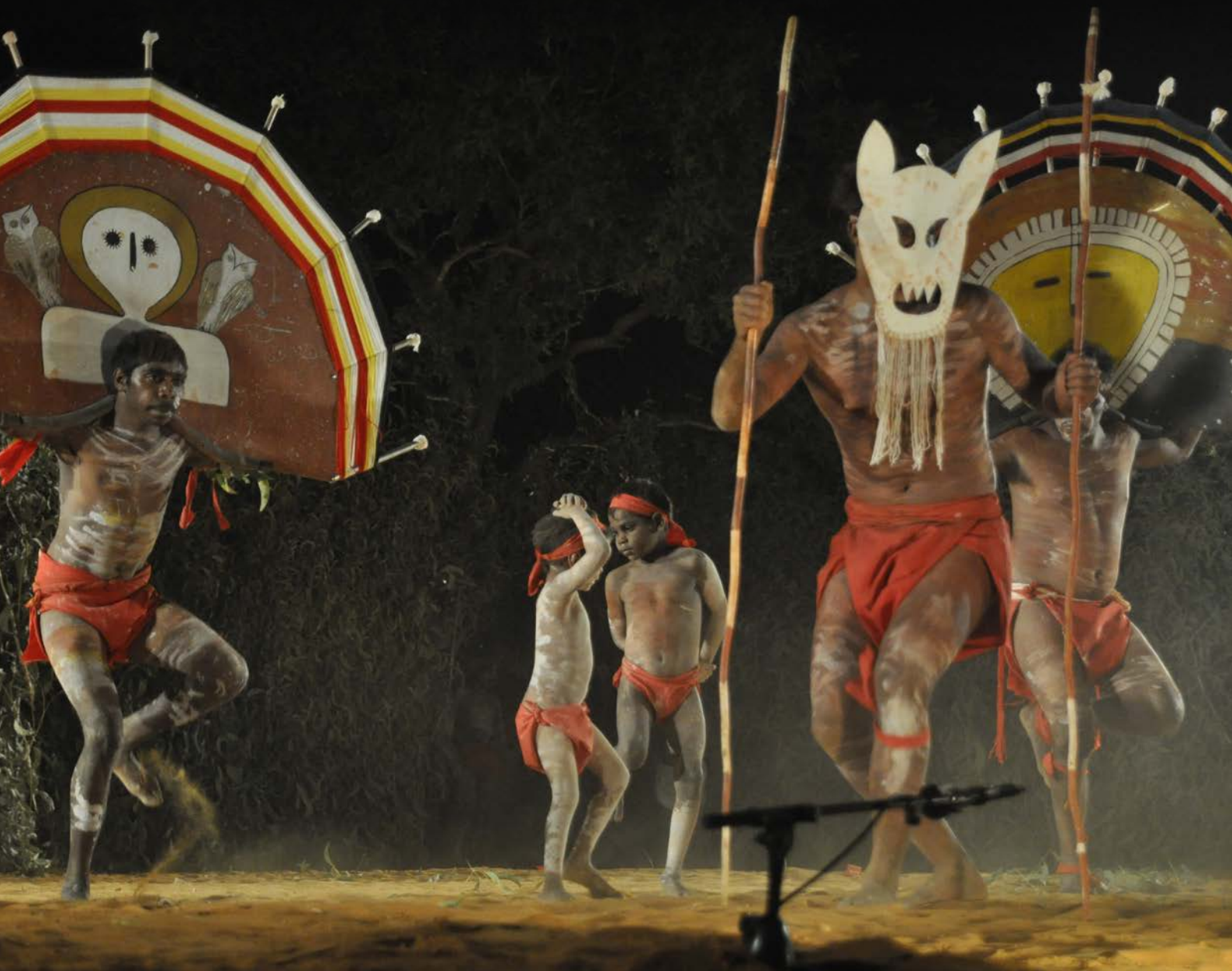
Ngarinyin dancers at KALACC Festival.