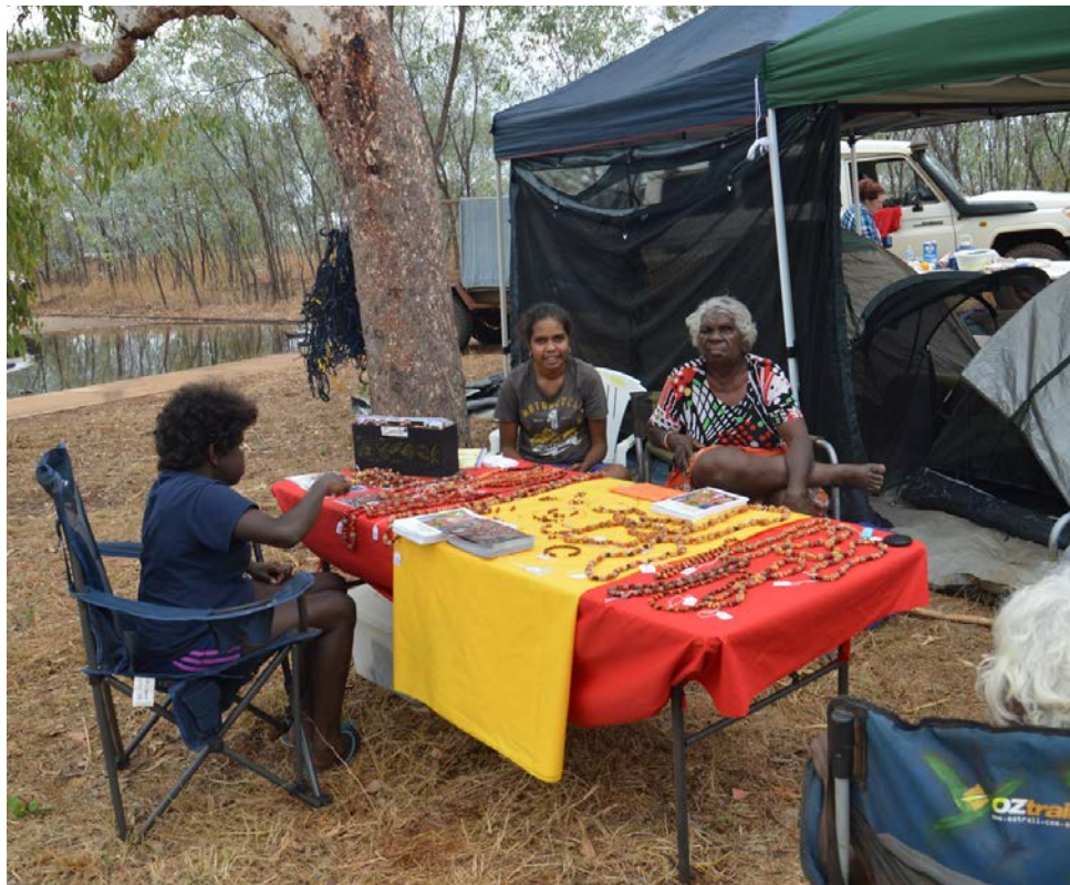
Yiriman Women – Traditional Jewellery Making Workshop on Country.