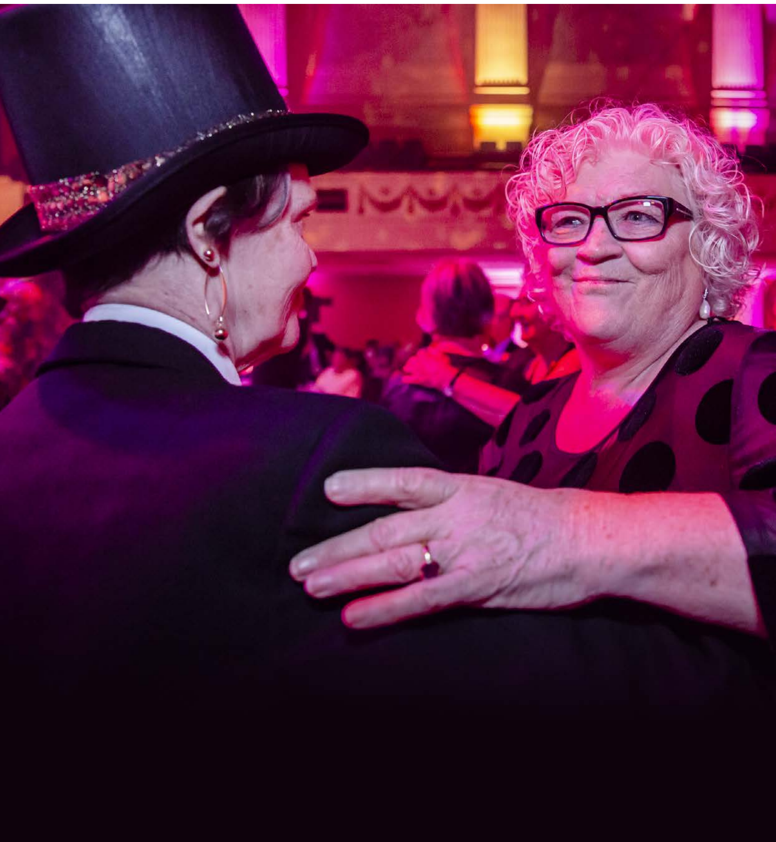
The Coming Back Out Ball 2018. Created and Produced by All The Queens Men.