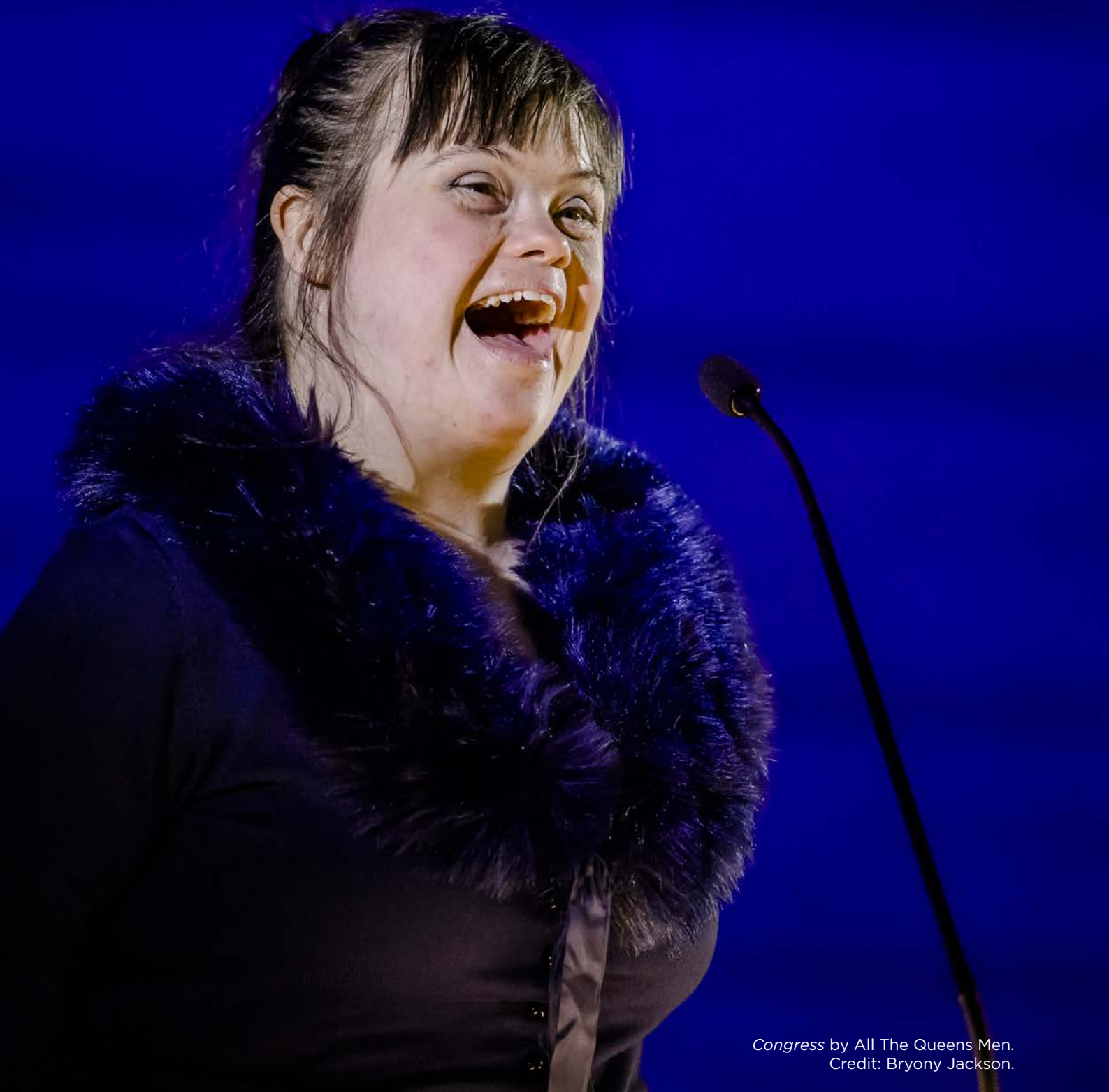
Congress by All The Queens Men.